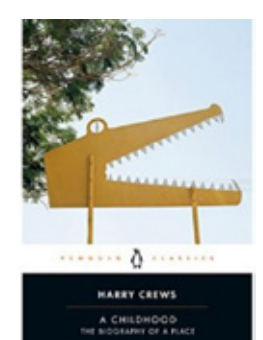
Figura 1. Cubiertas de A Childhood (1978, 1995 y 2022)

El ritmo creativo de Crews se redujo en la década de los ochenta y los noventa, si bien novelas como The Knockout Artist (1988), Body (1990) o Scar Lover (1992) retomaron la figura del freak sureño y hablaron de "gente haciéndolo lo mejor que pueden con el material que les ha tocado en suerte [...], familia, violencia, individuos desafectos, gente no convencional y una posibilidad de redención, que no siempre se alcanza" (Amat 20). Crews publicó su última novela, An American Family: The Baby with the Curious Markings en 2006.