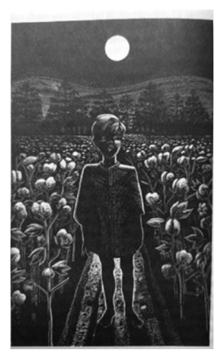
FIGURA 2. Ilustraciones de Michael McCurdy (Lucini 84 y 102)

Crews en el contexto norteamericano ha contribuido a que A Childhood se reeditara en marzo de 2022 en la colección Penguin Classics. La cubierta de esta edición, más figurativa que la anterior, alude a un peritexto interesante (derecha de la Figura 1): incluye un prólogo de Tobias Wolff, donde el escritor habla de cómo Crews le influyó a la hora de trabajar en su propia autobiografía, This Boy's Life (1989), acentuando, una vez más, el impacto que A Childhood ha tenido en la tradición de memorias sureñas.